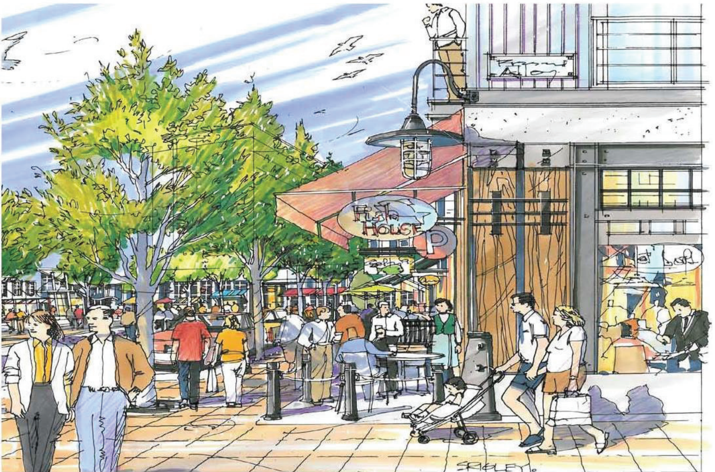
Figure 16-2: Sketch of Desired Form and Character in the Village Landing Area