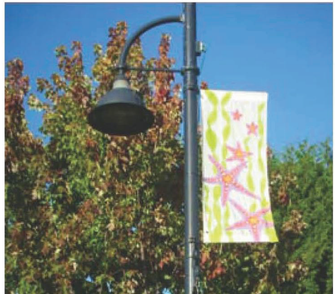
Figure 16-3: Marine Light Fixtures