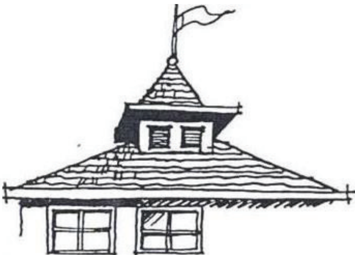
Figure 16-5: Cupola Roof