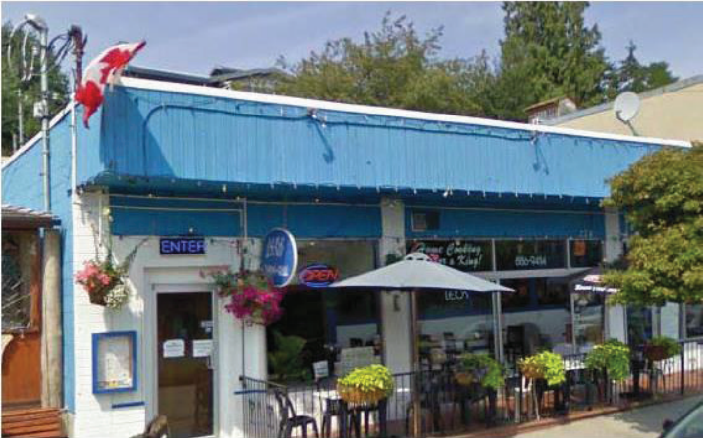
Figure 16-7: Transparency in Shop Front Facades