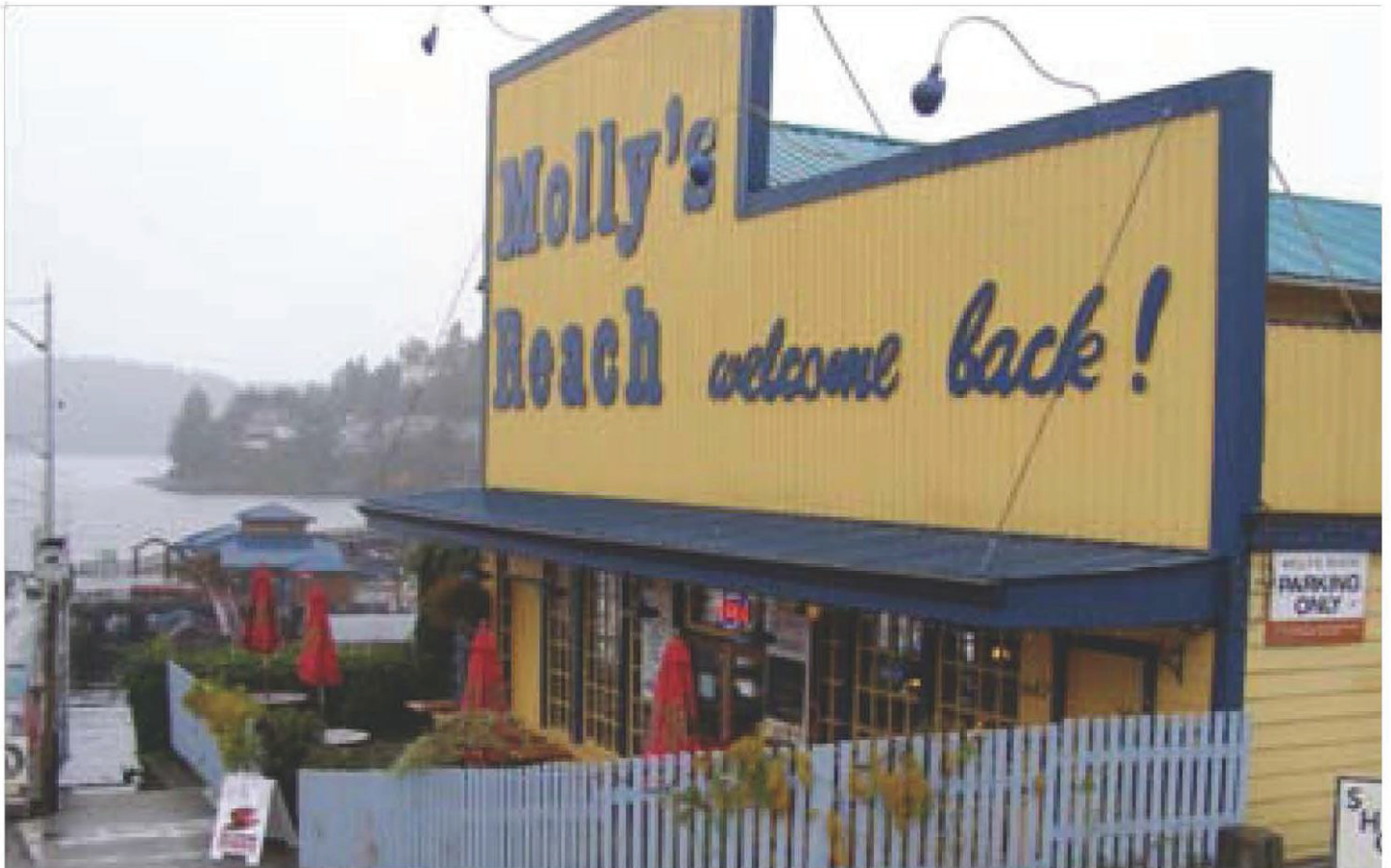
Figure 16-8: Molly's Reach Signage