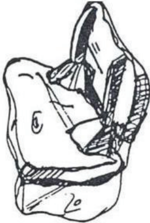
Figure 16-4: Street Furniture Which Reinforces Sense of Place