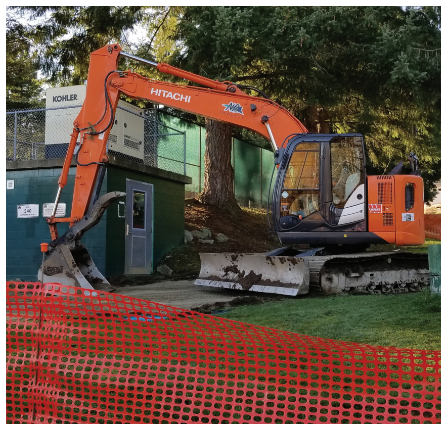
Excavator prepping for well-drilling work in Dougall Park, January 2019.

In 2018, Council provided pre-budget approval for the drilling of a supply well in Dougall Park to provide additional water for the pending expansion into Zone 3, as well as providing capacity for the buildout of the Town. This work was completed in February 2019.