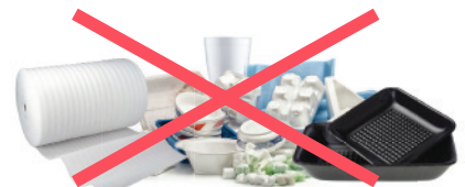
NO Foam NO meat trays, foam wrapping, packaging or take out containers