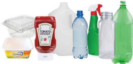
Plastic Bottles, Jugs and Tubs Must be numbered #1, #2, #5

Accepted materials must be clean and dry