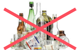
NO Glass Clean metal lids from jars are okay in your recycling bin