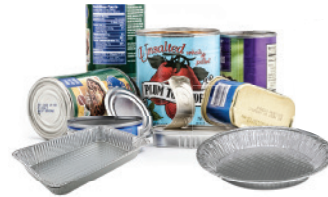
Metal Cans and Containers Cookie sheets and pots and pans are okay