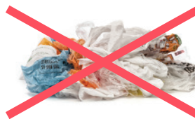
NO Plastic Bags, Film or Cellophane