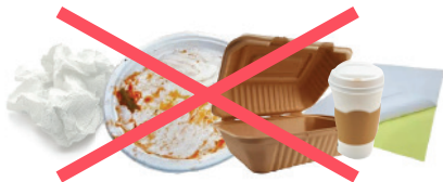
Not all paper is recyclable NO paper towels/napkins, paper plates, fiber clamshells, tissue paper, laminated paper, sticker paper, food or liquid soiled paper, or waxed cardboard