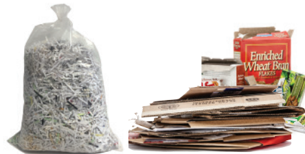
Mixed Paper Paper, boxes and non-waxed cardboard; shredded paper in a clear plastic bag