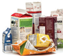
Food & Beverage Cartons Clean and empty