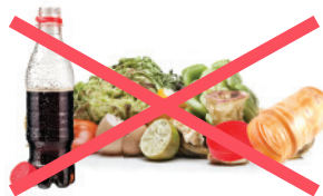
NO Food or Liquids Accepted materials with food or liquid residue CANNOT go in your bin.