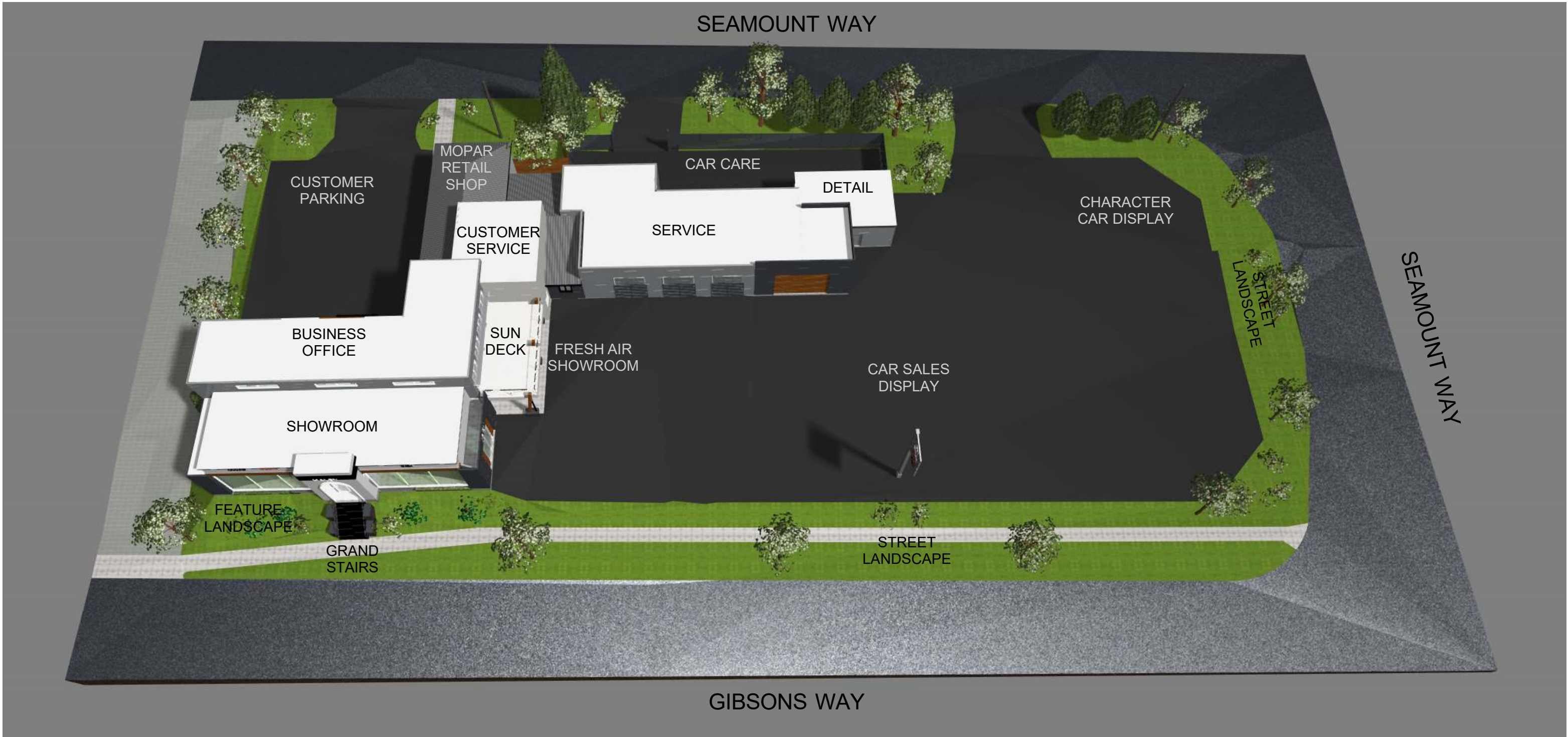
SOUTH AERIAL IMAGE