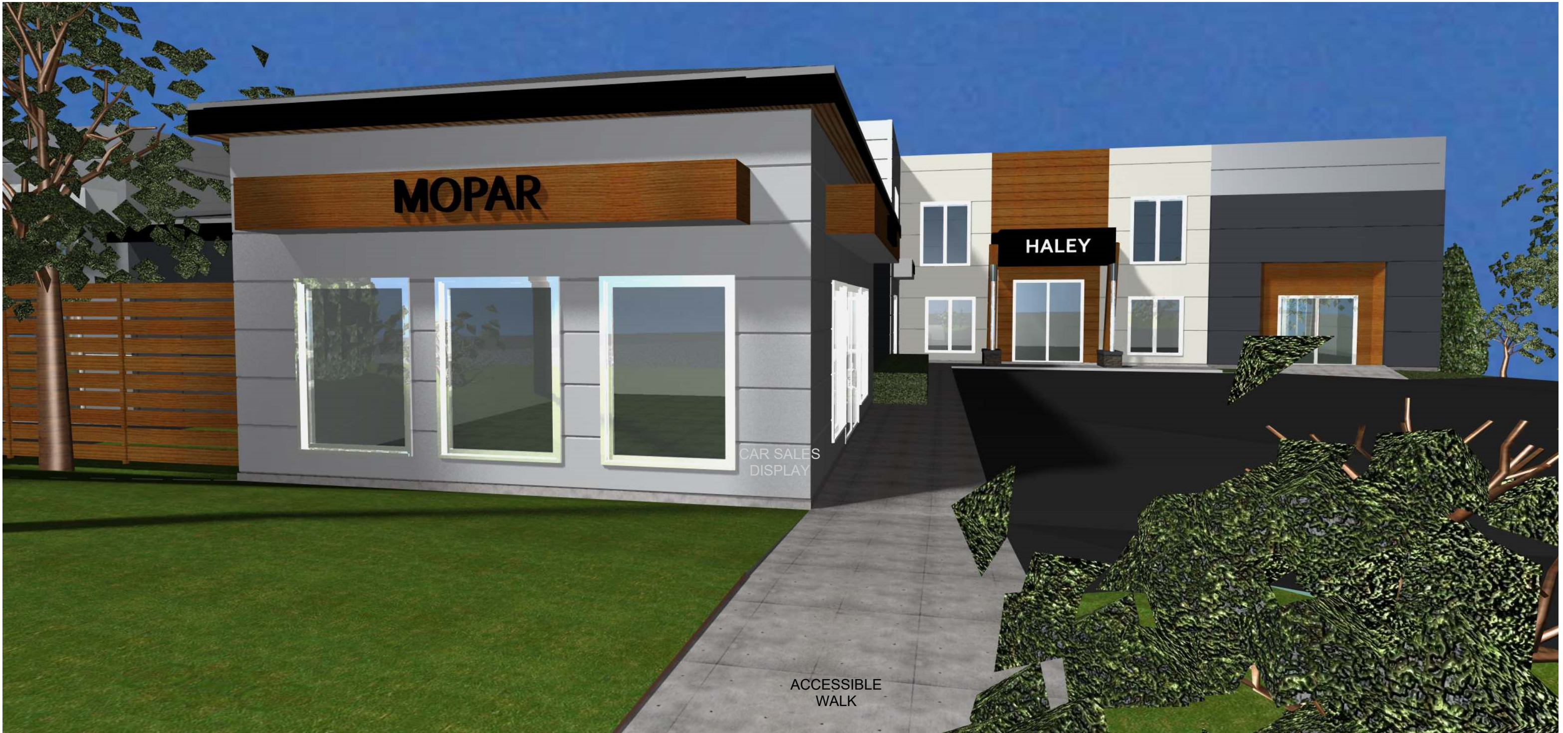
SEAMOUNT WAY STOREFRONT IMAGE