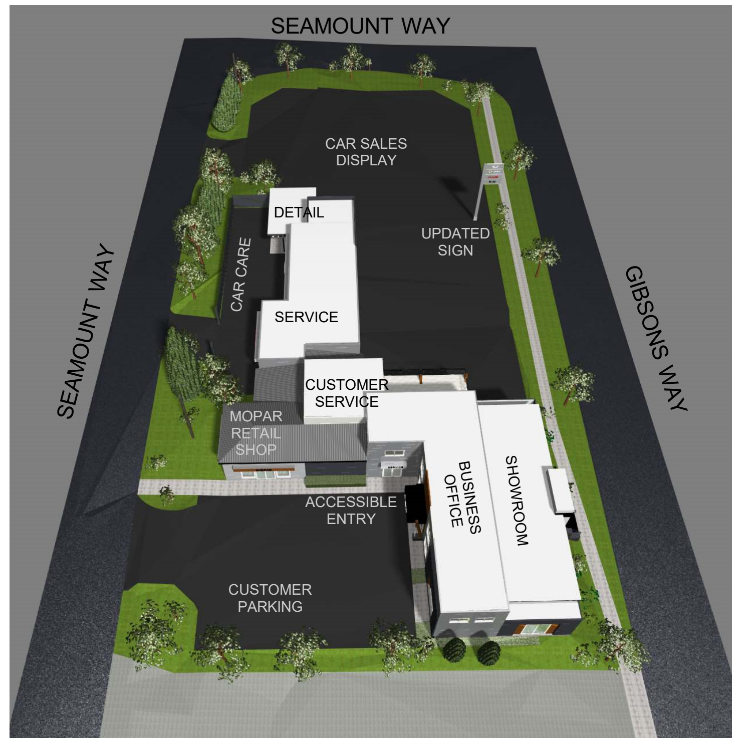
WEST AERIAL IMAGE