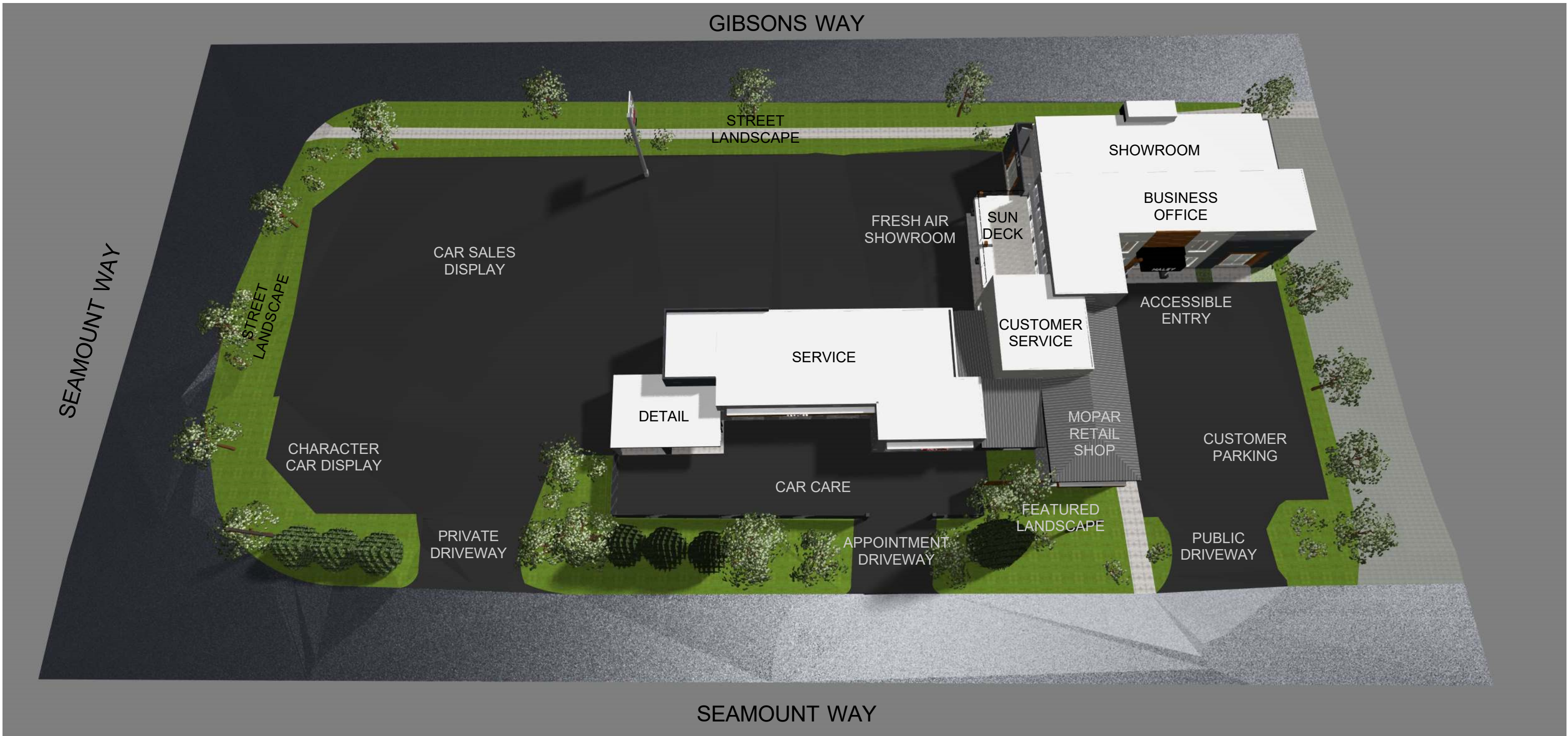
NORTH AERIAL IMAGE