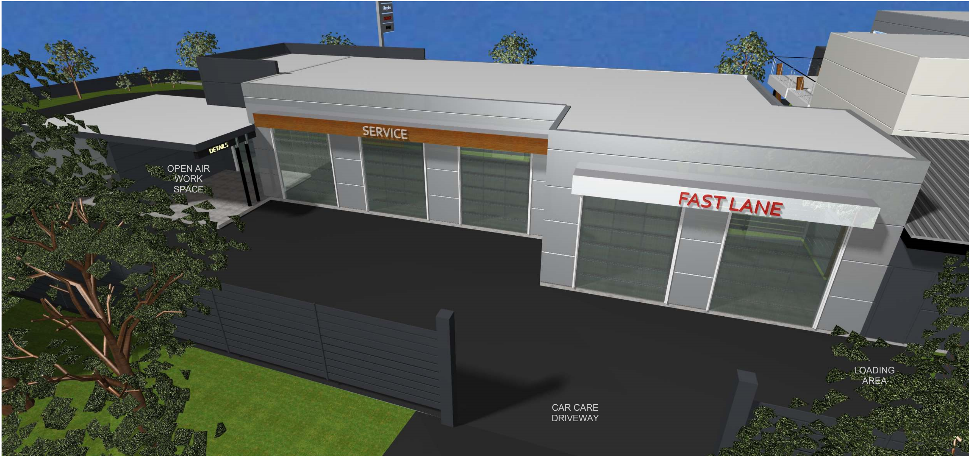
SEAMOUNT WAY CAR CARE IMAGE