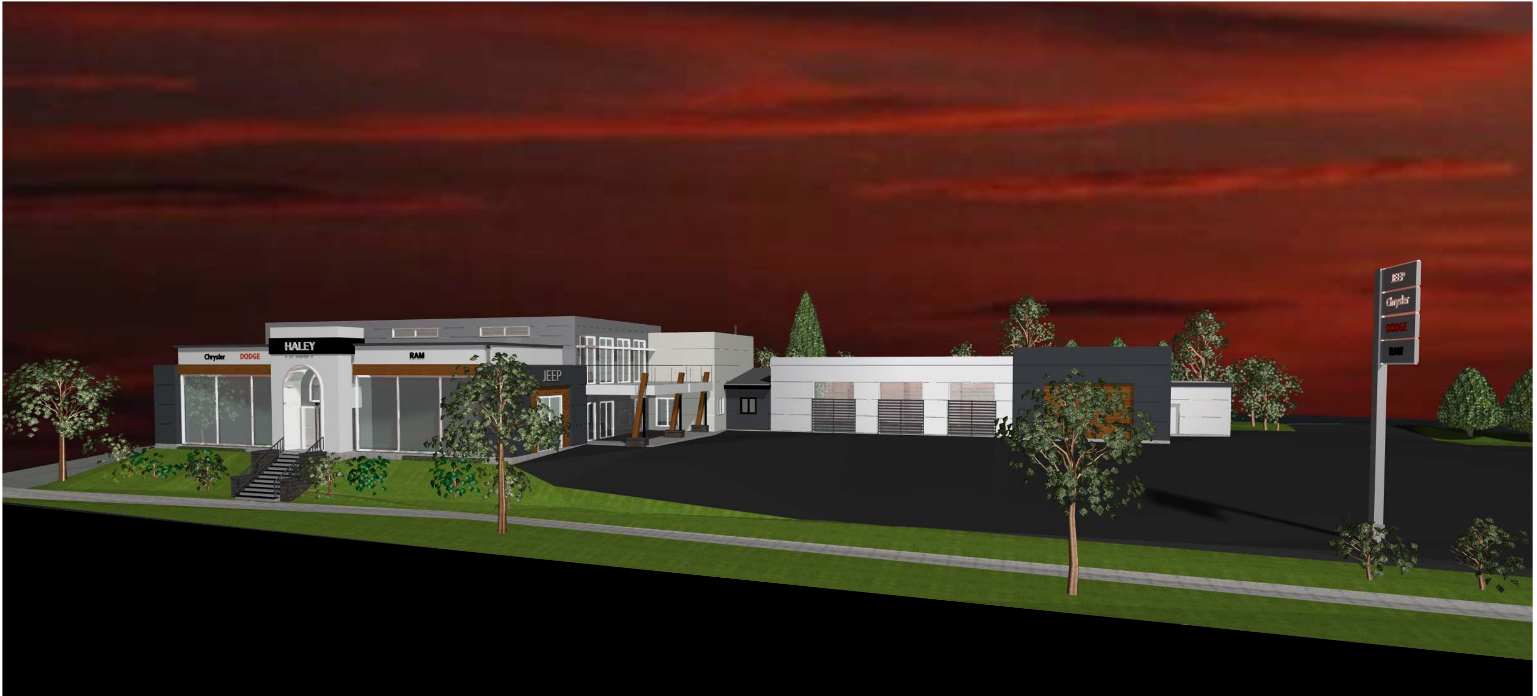
GIBSONS WAY STREET IMAGE