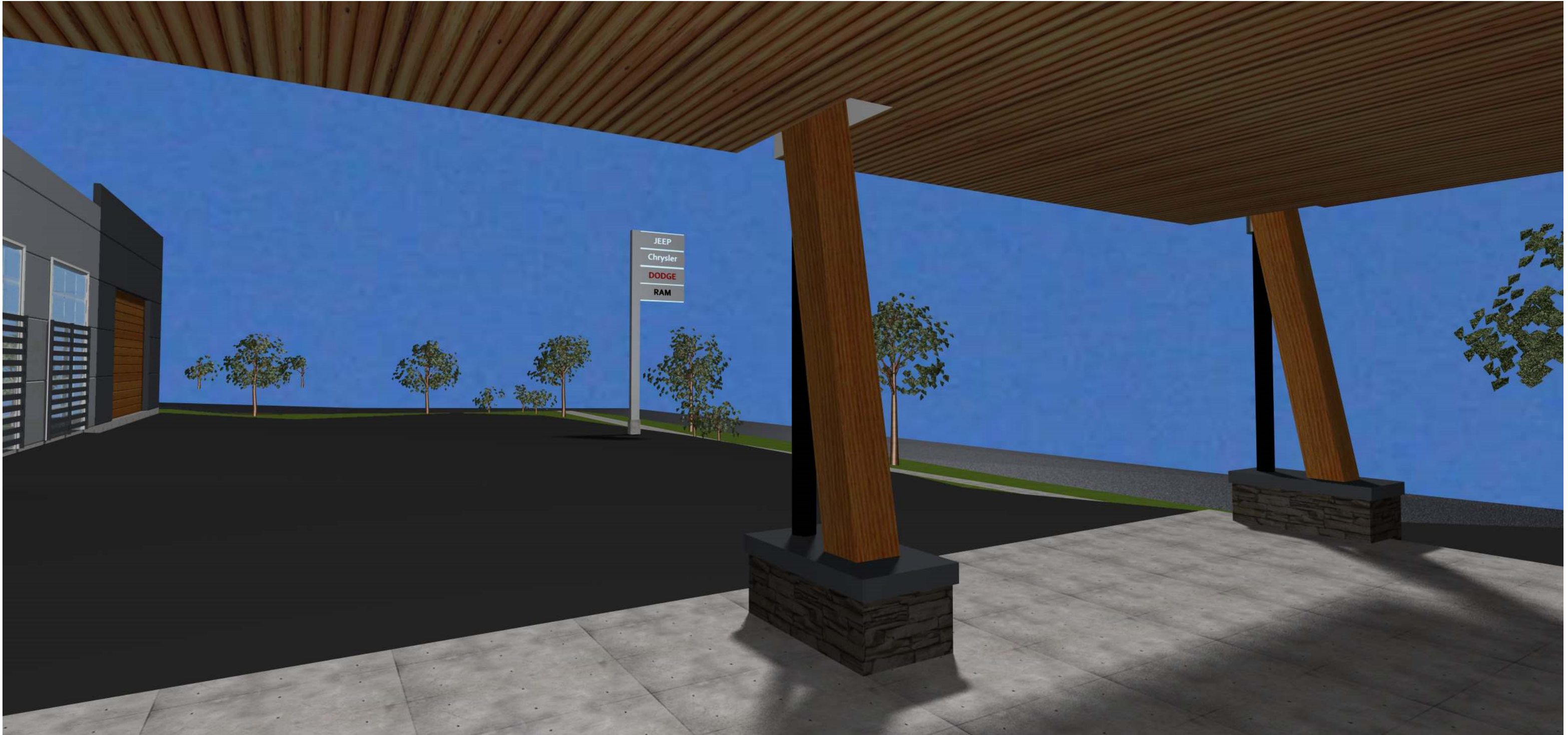
FRESH AIR SHOWROOM IMAGE