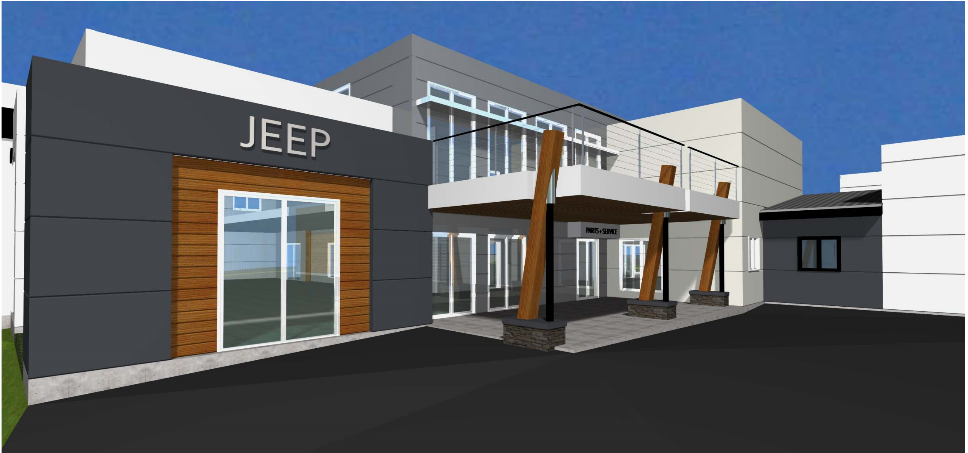
SUN DECK IMAGE