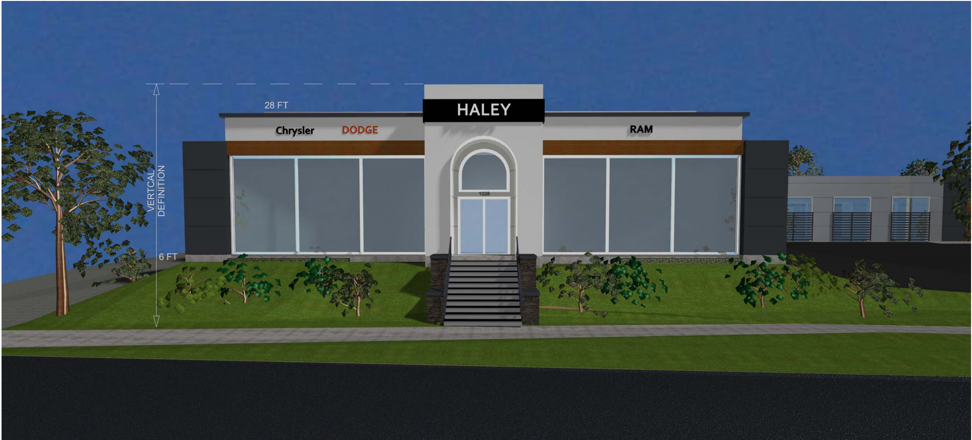
GIBSONS WAY GRAND STAIR ENTRY IMAGE