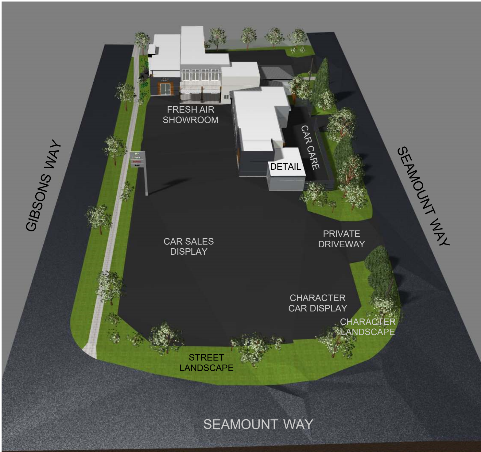
EAST AERIAL IMAGE