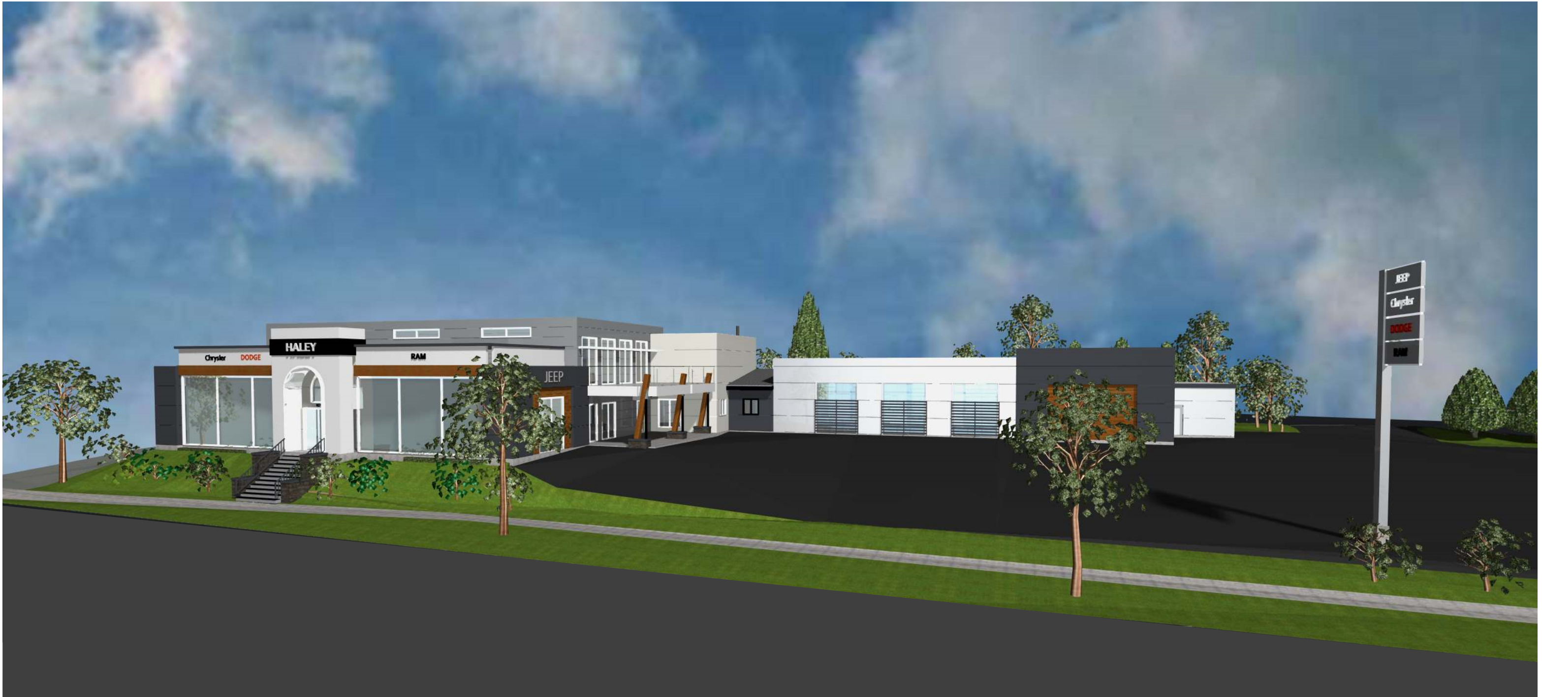
GIBSONS WAY STREET IMAGE