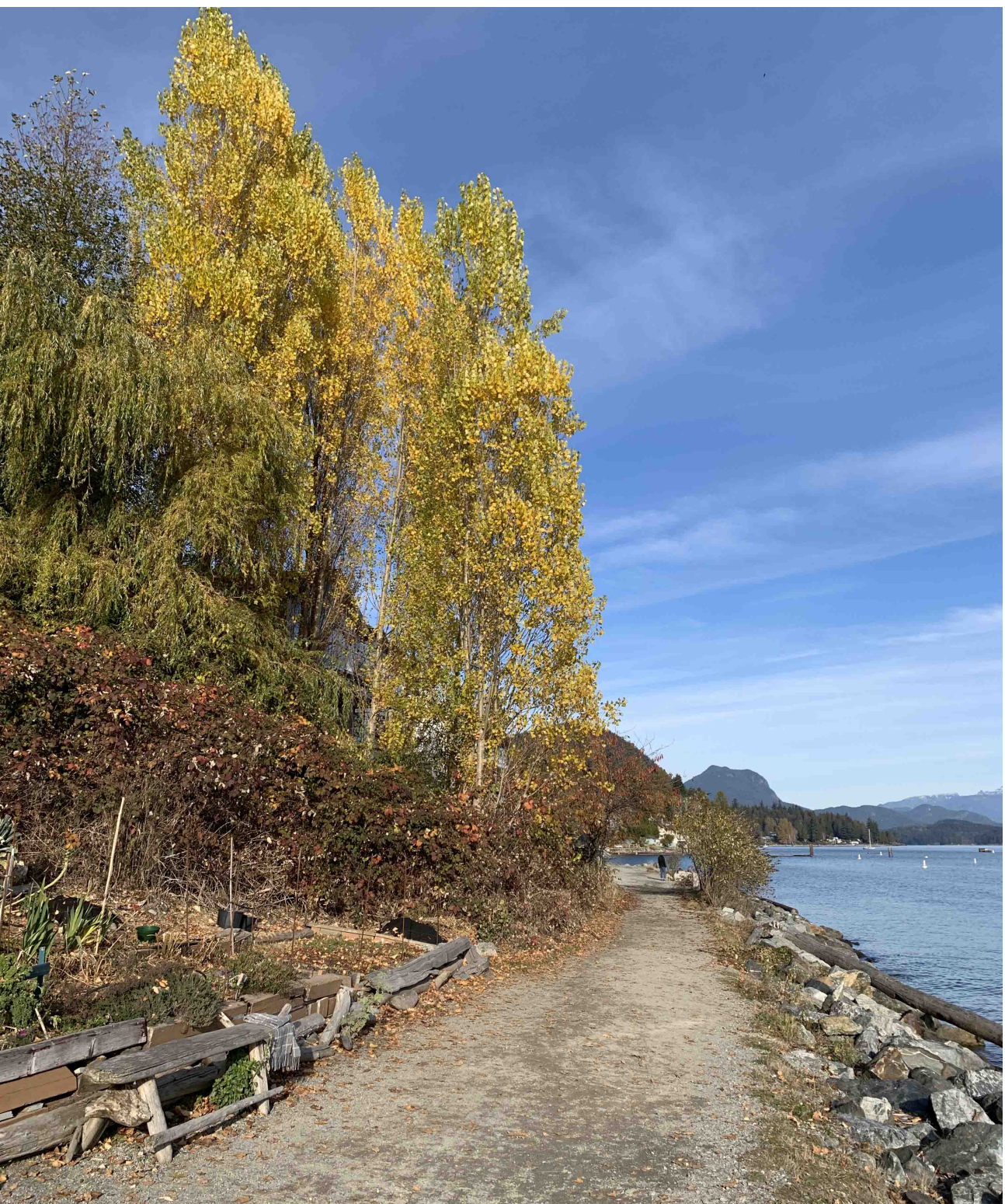
EXISTING SITE CONTEXT