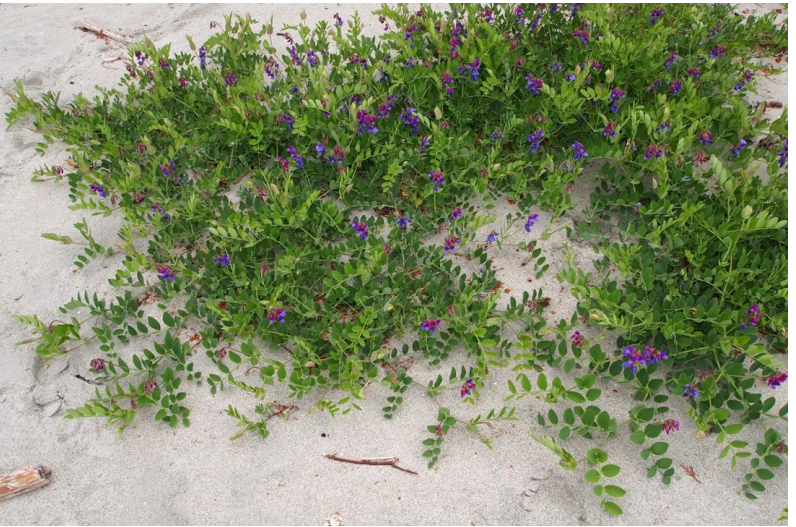
Lathyrus japonicus (lj)