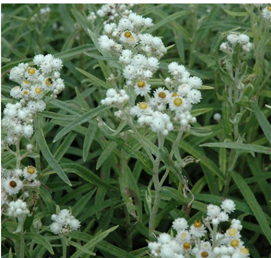
Anaphalis margaritacea (an)