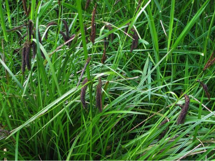
Carex obnupta (co)