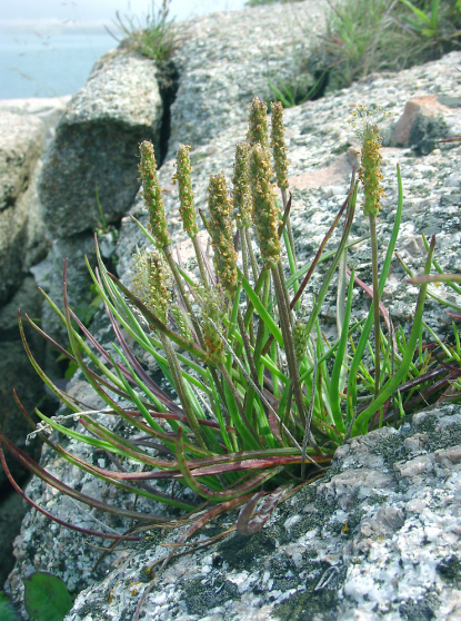
Plantago maritima (plm)