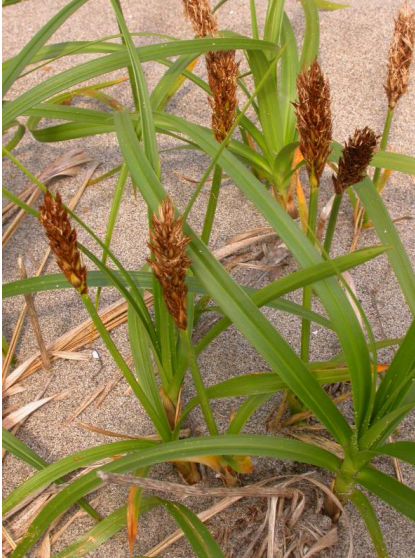
Carex macrocephala (cm)