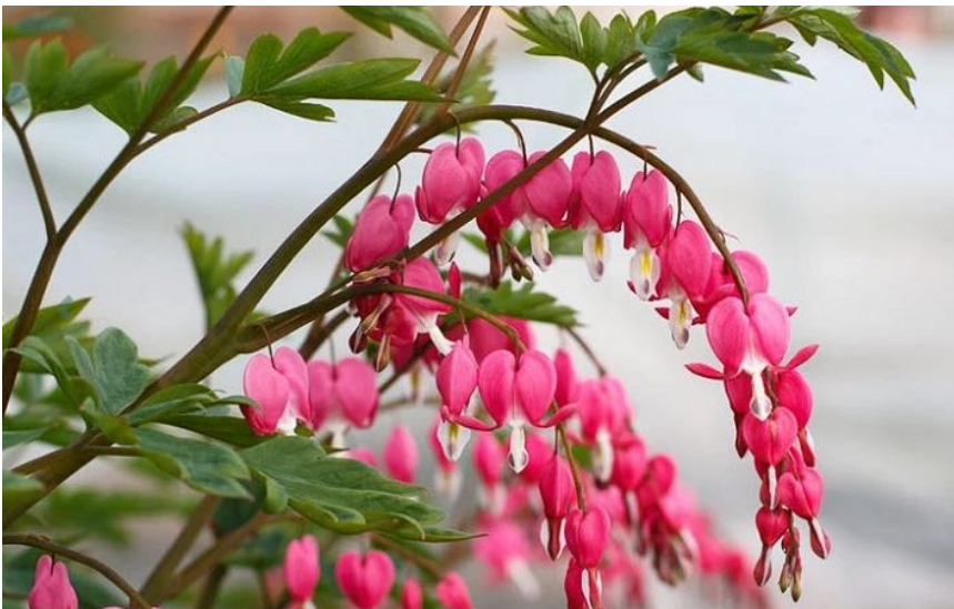
Dicentra spectabilis (ds)