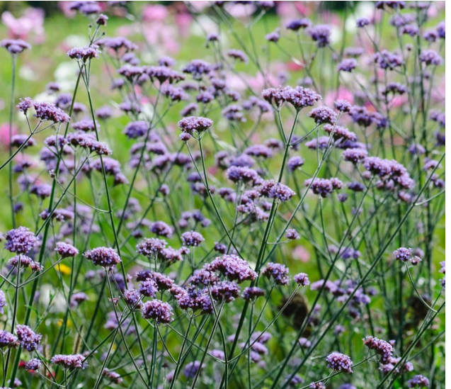
Verbena bonariensis (vb)