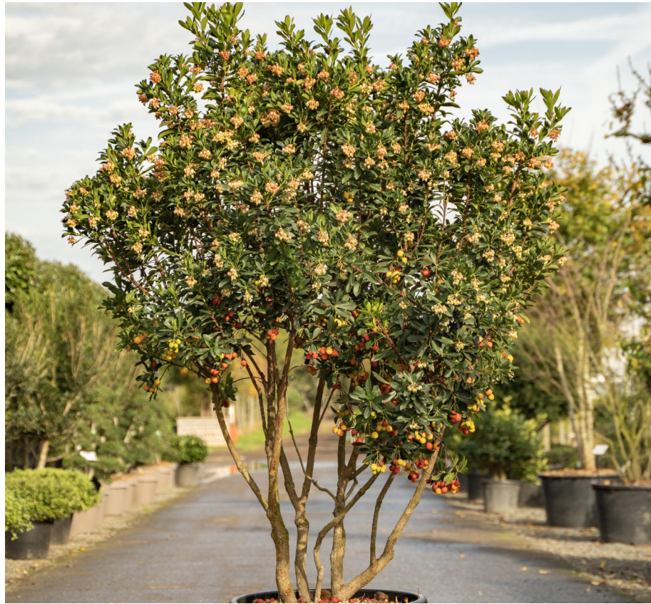
Arbutus unedo 'Compacta' (Au)