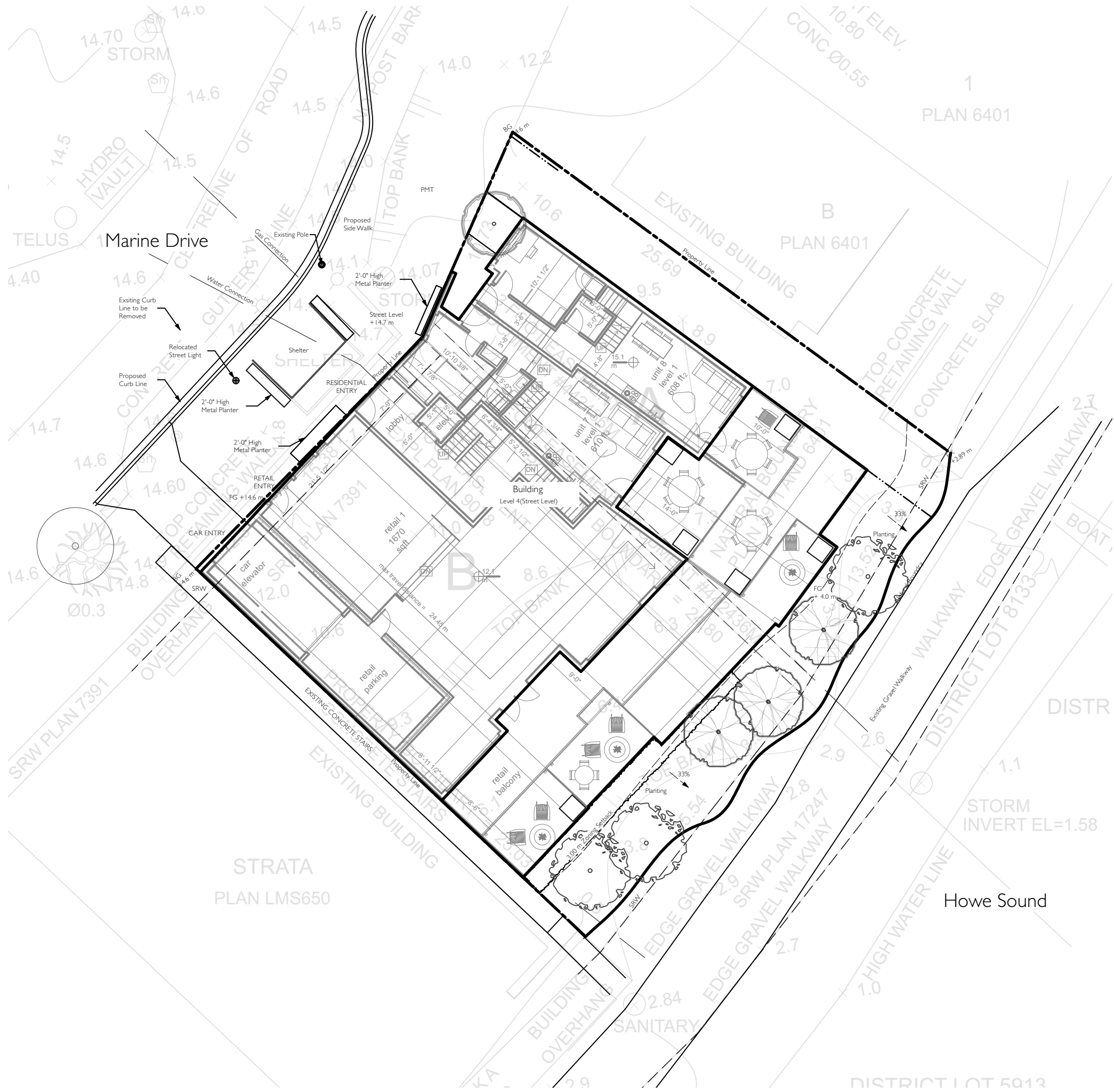
1 SITE PLAN Scale: 1/16" = 1'-0"