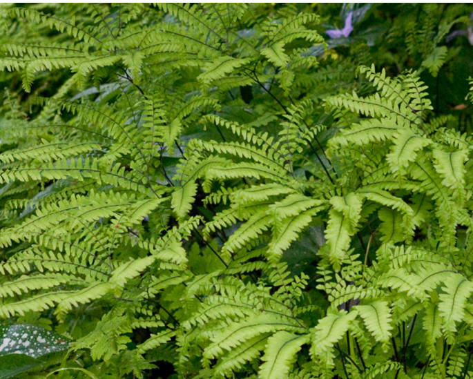
Adiantum venustum (av)