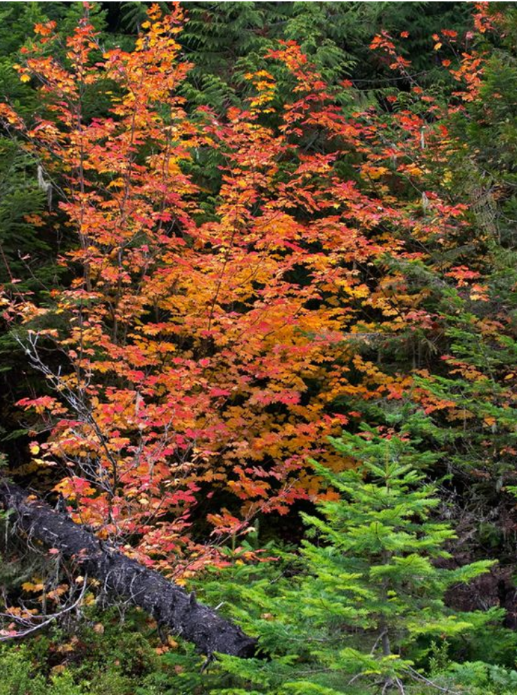
Acer circinatum (ACc)