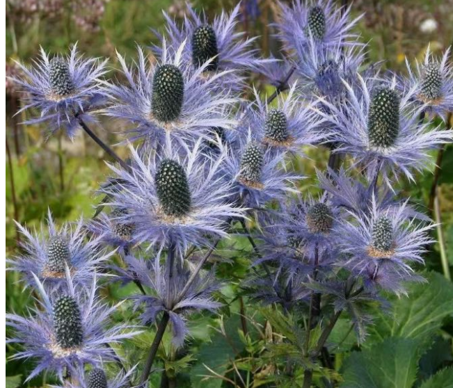
Eryngium alpinum (ea)