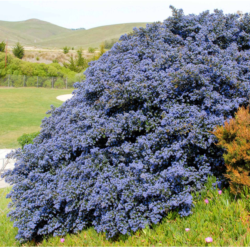
Ceanothus 'Dark Star' (Cd)