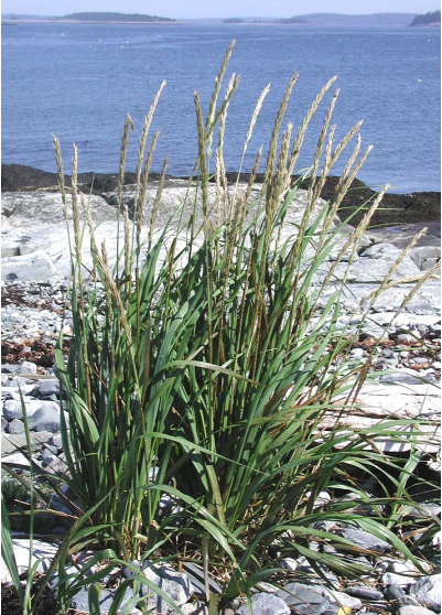
Leymus mollis (lm)