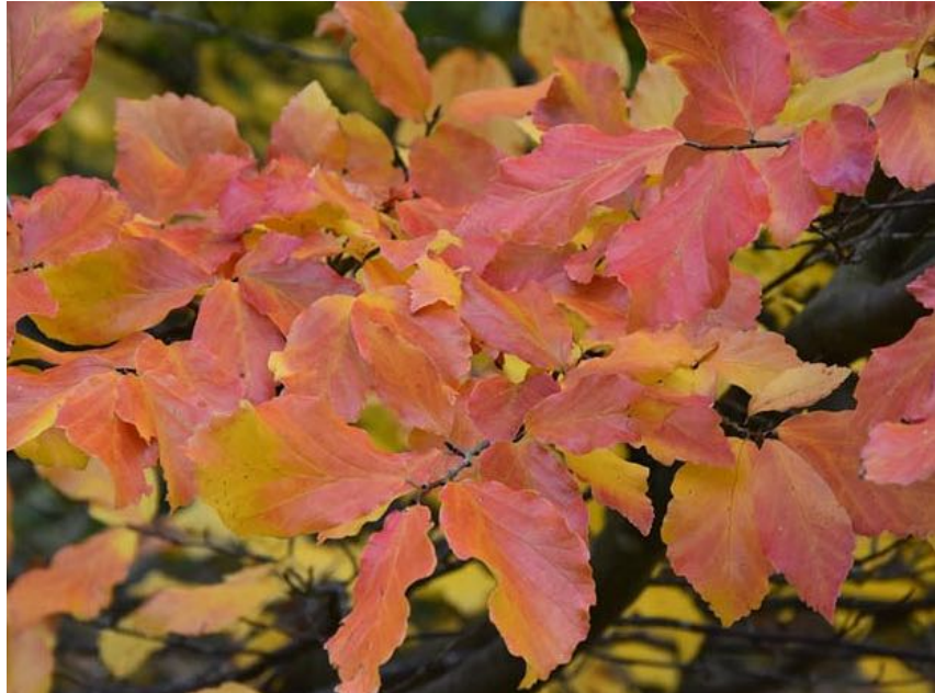
Parrotia persica 'Vanessa' (PP) fall color