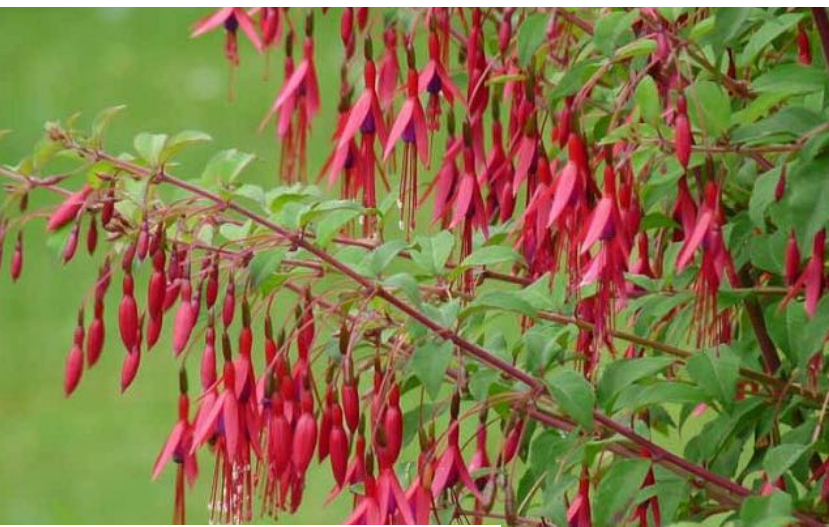
Fuchsia magellanica var. gracilis (fm)