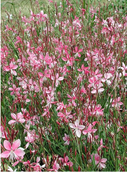
Gaura lindheimeri (gl)