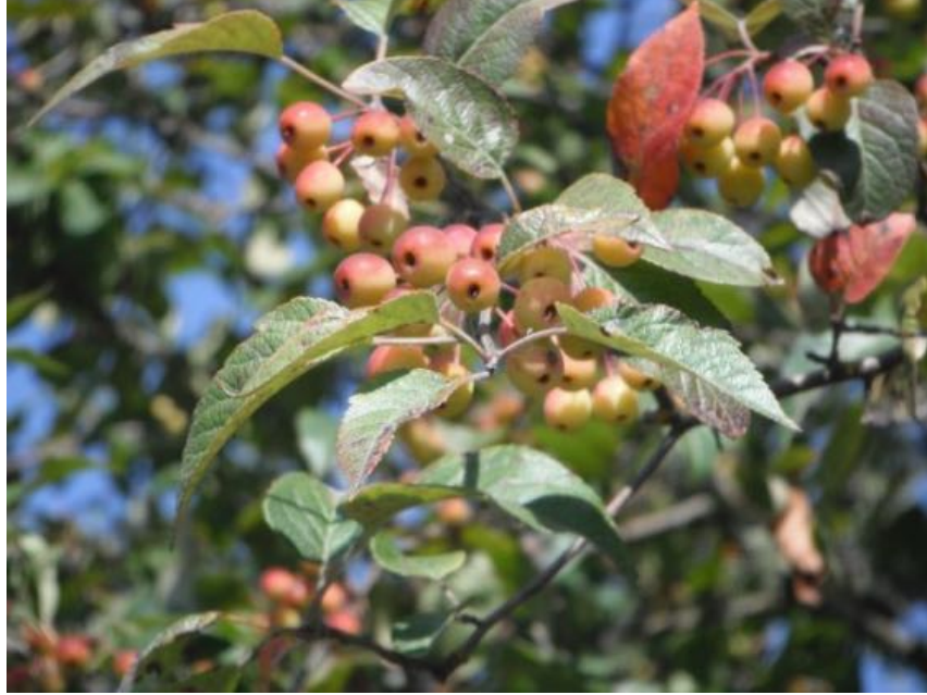
Malus fusca (ML) leaves & fruits