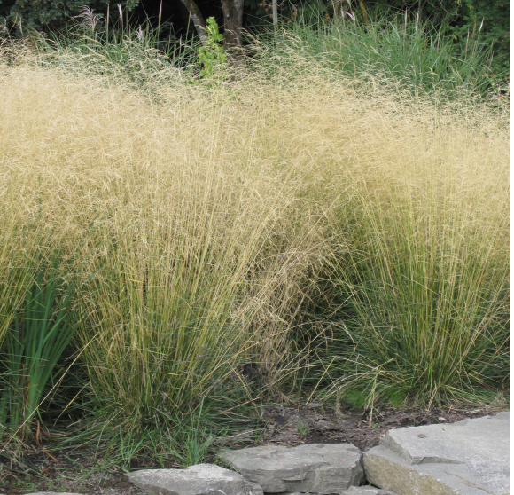
Deschampsia cespitosa (dc)