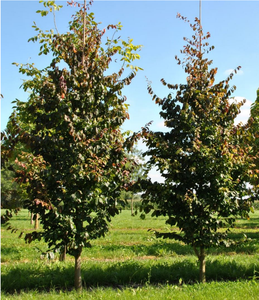
Parrotia persica 'Vanessa' (PP)