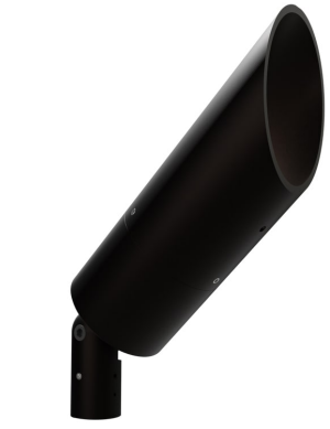
▲ TREE UP LIGHT