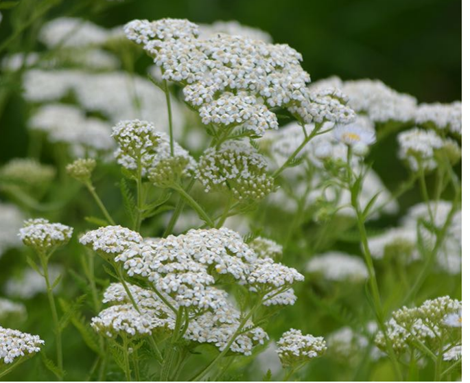
Achillea millefolium (am)