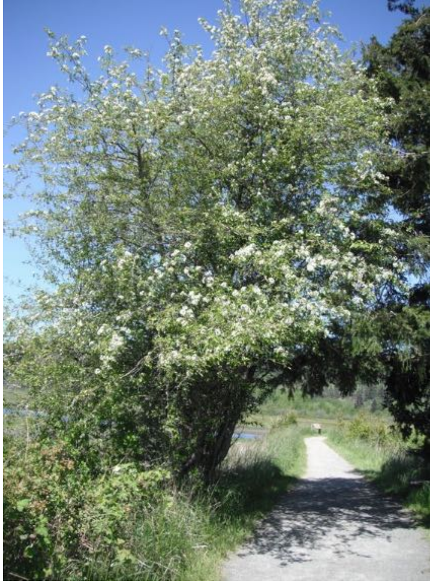
Malus fusca (ML)