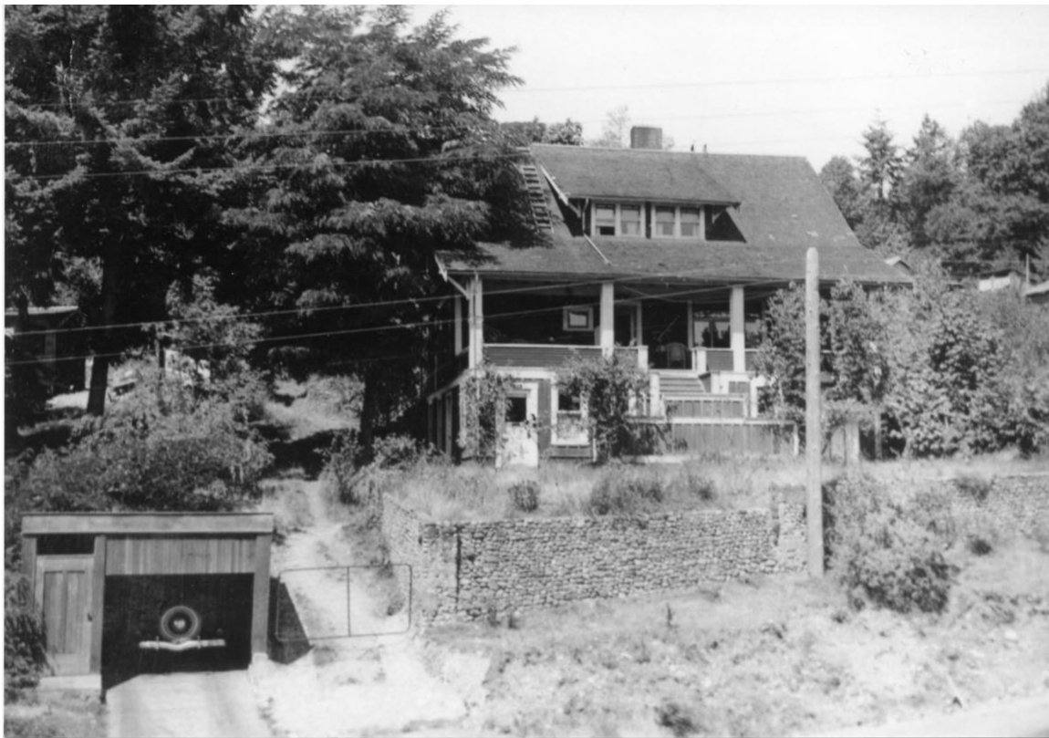
1940. Stonehurst [SCMA 2089]