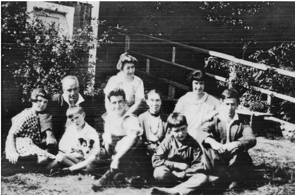
1920. Inglis family at Stonehurst [SCMA 2106]