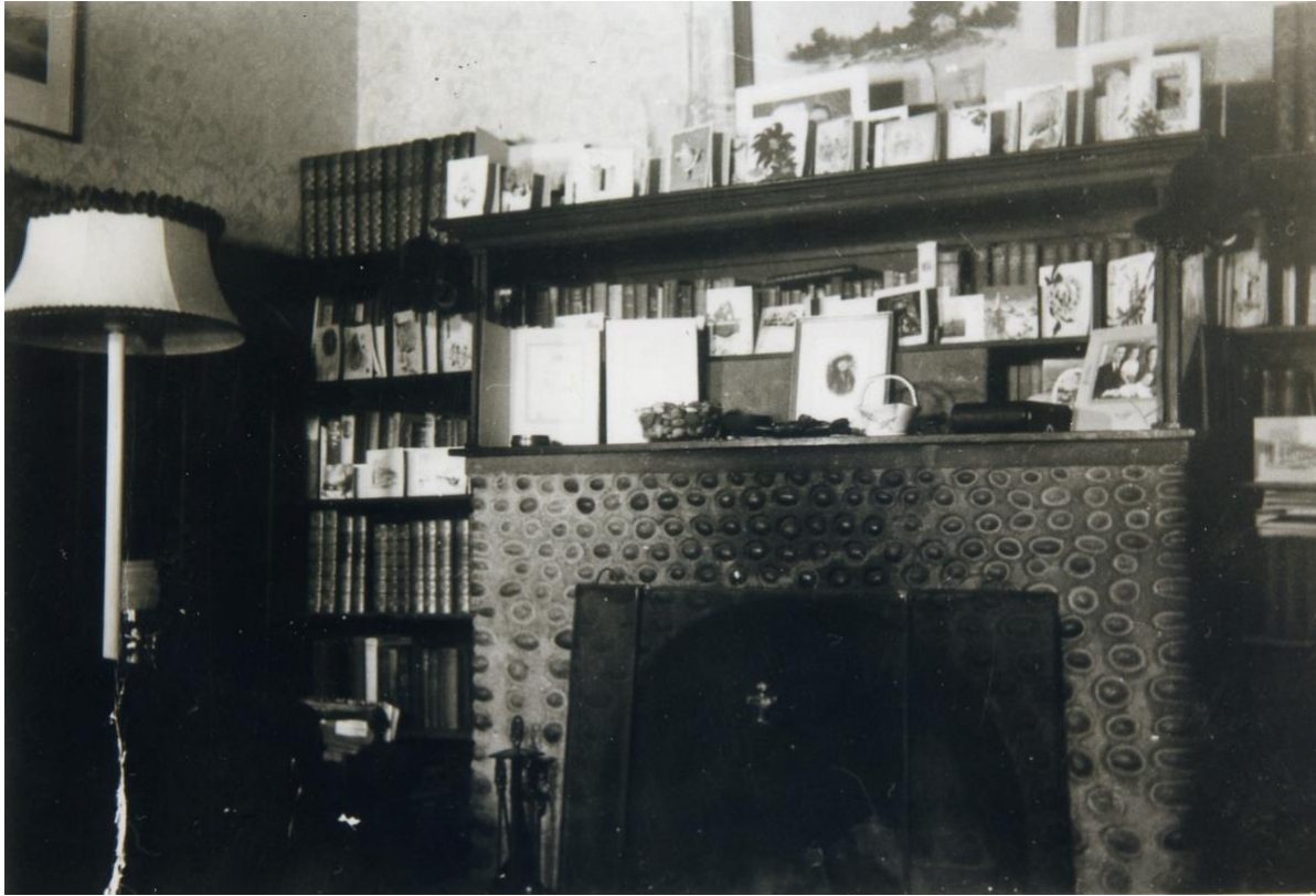
1944. Interior of Stonehurst [SCMA 2085]