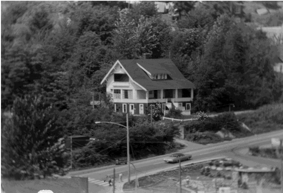
1950s. Stonehurst [SCMA 2245]