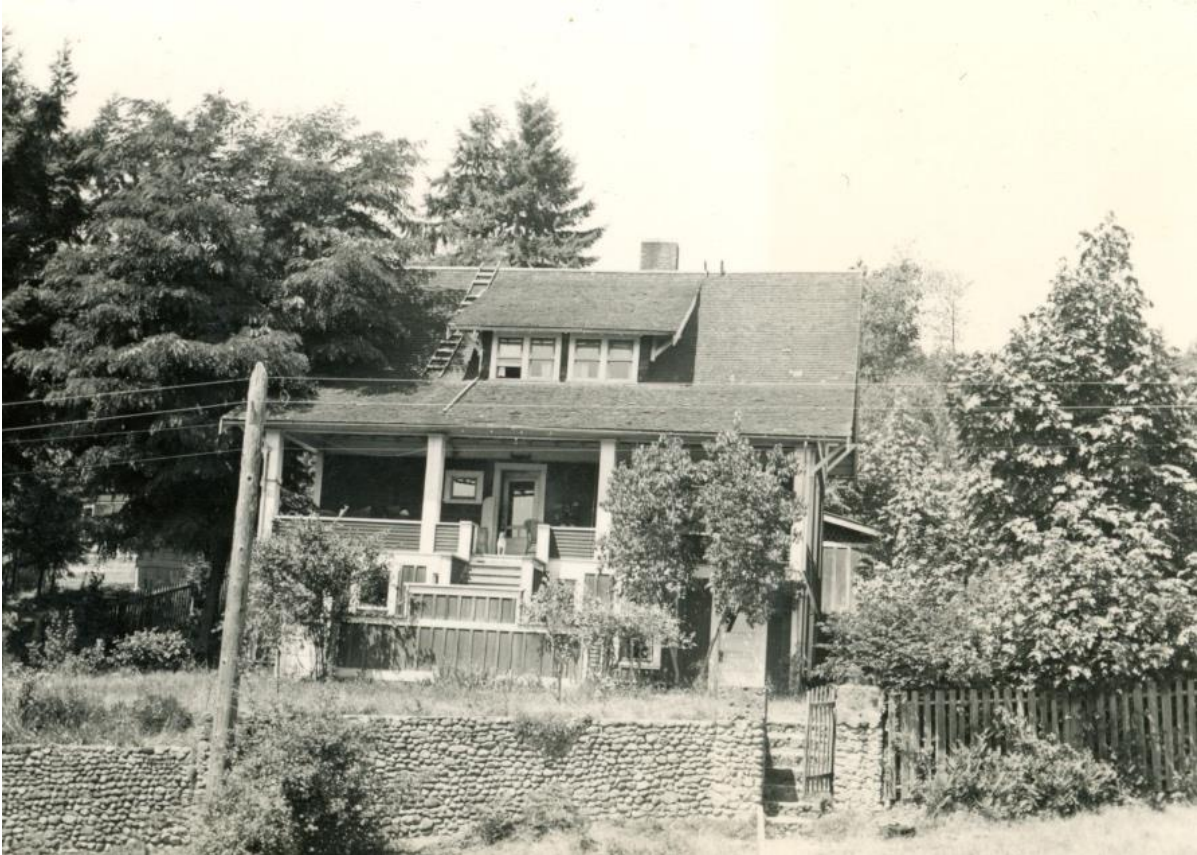
nd. Stonehurst (a) [SCMA]