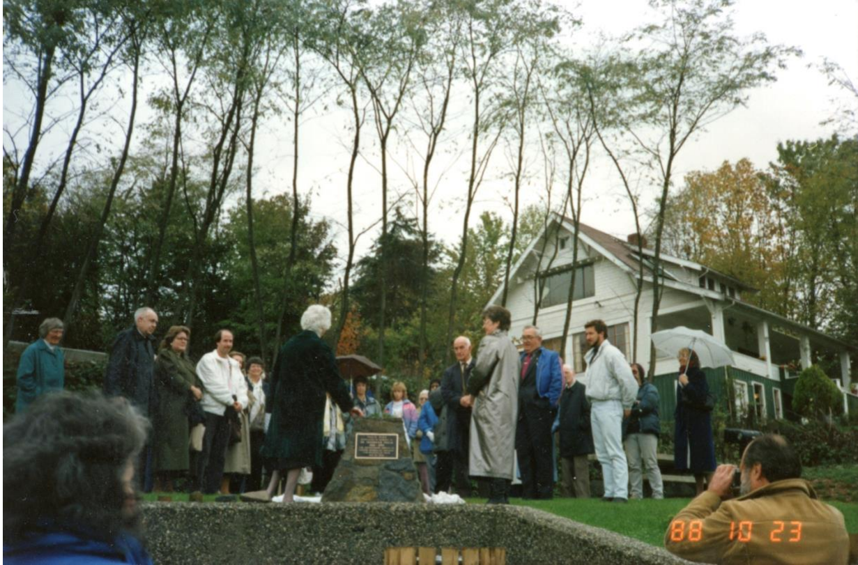
1988-10-23. Inglis Park dedication (a)