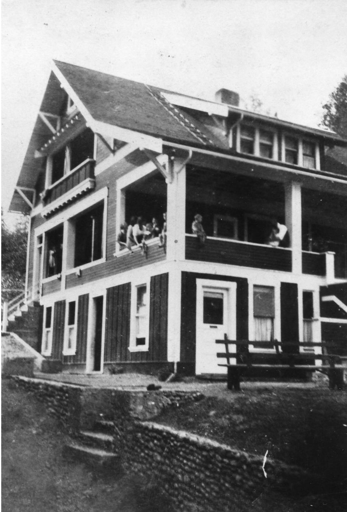
1920. Stonehurst [SCMA 2086]