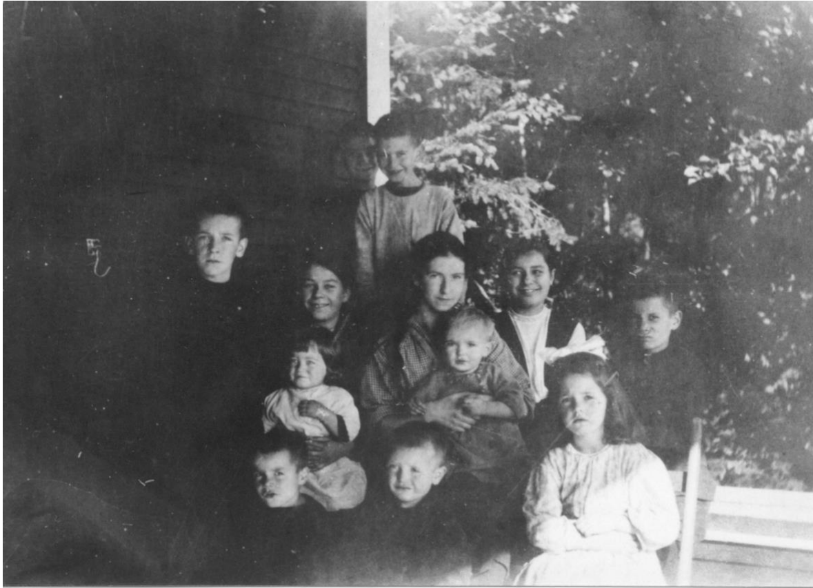
1918. Woodsworth and Inglis children on Stonehurst verandah