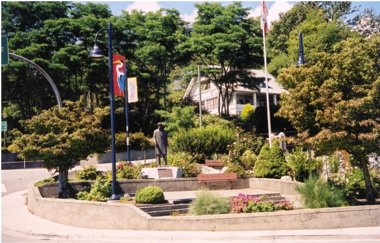
1990. Stonehurst [SCMA 4951]