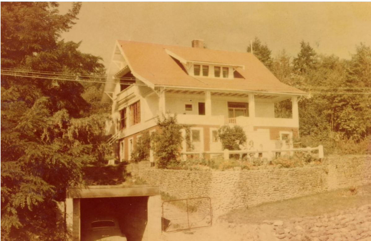
nd. Stonehurst (b) [SCMA]