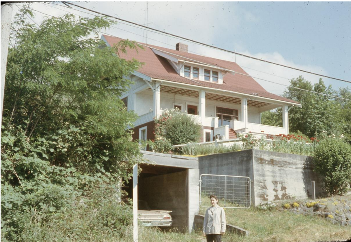
nd. Stonehurst (d)