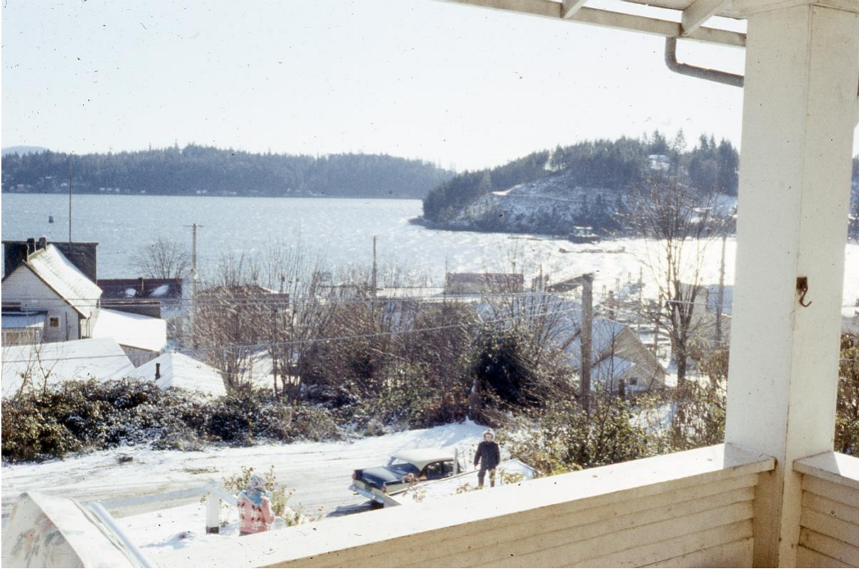
nd. Stonehurst