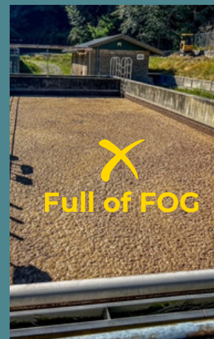
Photos from the Gibsons Wastewater Treatment Plant