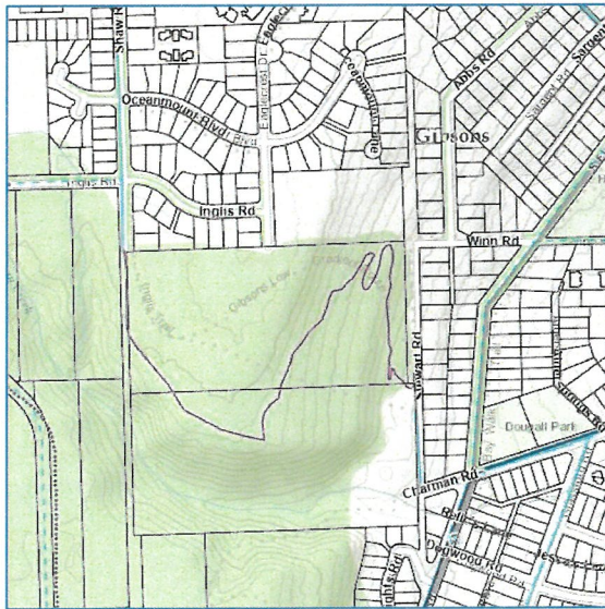
Figure 2: Inglis Trail / Helen's Way, shown in purple, connecting Shaw Rd to Stewart Rd