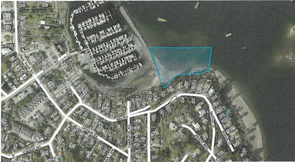
Figure 1: Headlands Beach, year-round off-leash dog beach